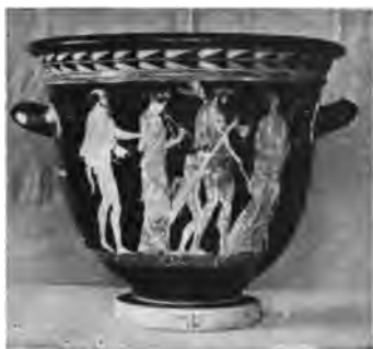
Fig. 50. Bacchic Procession.

triumphal car, drawn by lions or panthers, while about him throng his followers, Satyrs, Sileni, Mænads (see p. 179), mingling with his votaries, the Bacchantes, who brandish snakes or ivy-twined staves.